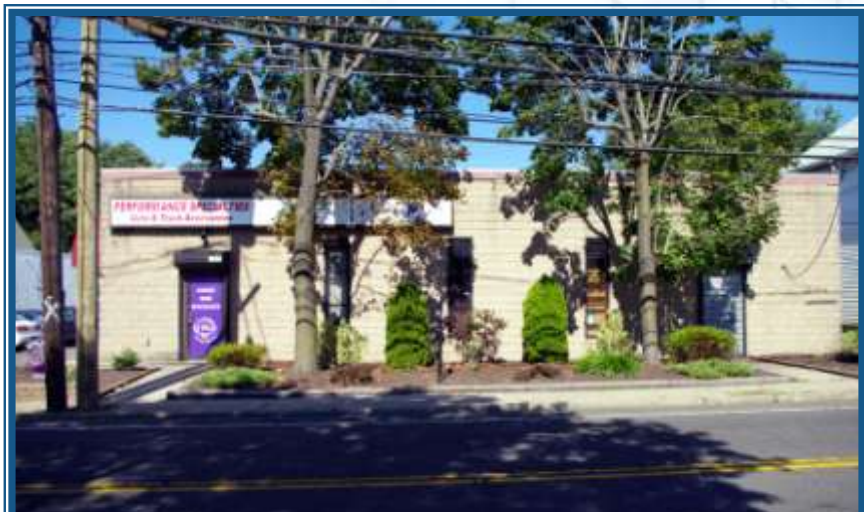
10 Cross Street, Norwalk CT 06851